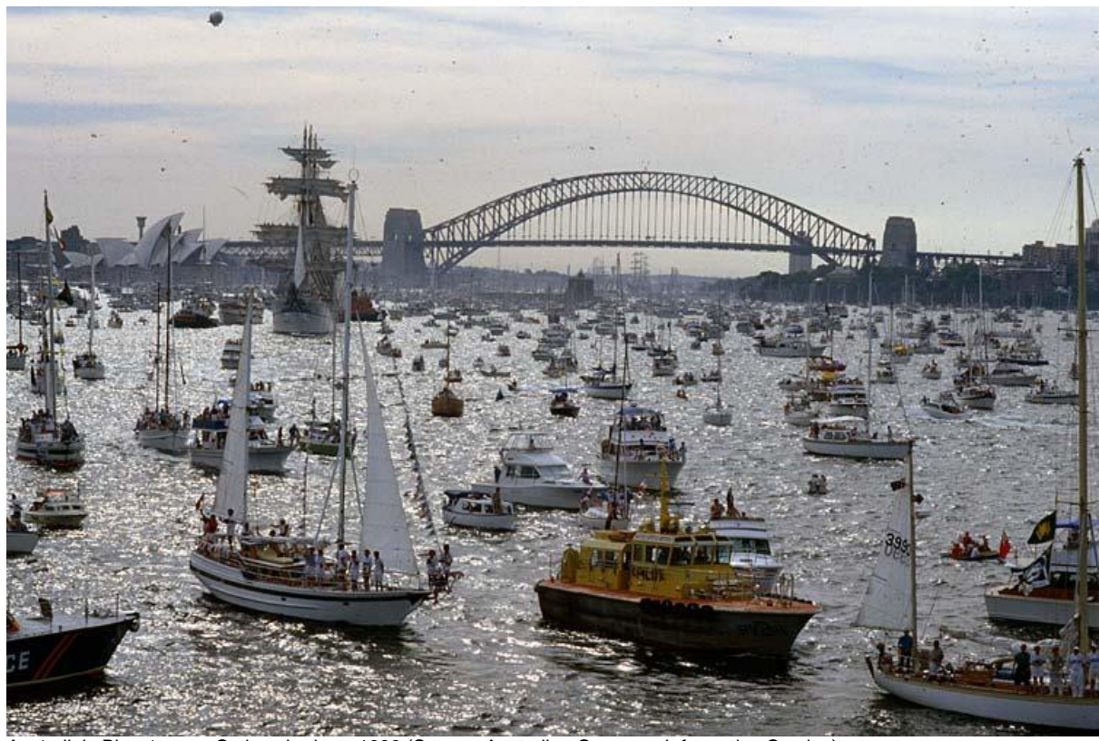
Australia's Bicentenary- Sydney harbour 1988