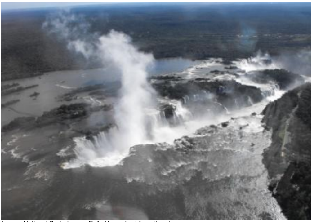
Iguaçu National Park- Iguacu Falls (Argentina) from the air

Views of waterfalls, rivers and seas continue to inspire photographers, whether professional or amateur, capturing as they do the beauty or grandeur of nature in a way that calls to the human spirit. The Iguacu National Park spanning the borders of Paraguay, Brazil and Argentina provides an outstanding example that must be one of the most photographed waterfalls in the world.