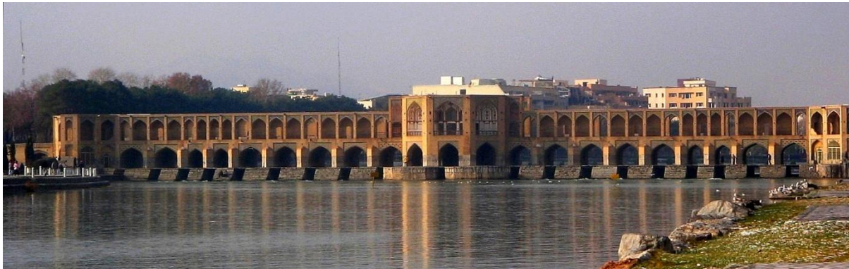
Kahju Bridge, Isfahan, Iran

Human creativity invented many ways to travel across water and boats were not always necessary. There is an amazing variety of bridges that have been designed by architects and engineers through the ages to allow safe passage for people, goods and vehicles. There is a correspondingly wide range of building materials used in the creations of the world's most spectacular bridges. For example, consider the architectural beauty of the Khaju Bridge built in 1667 in Isfahan and the Kintai wooden arched bridge built in 1673 at Iwakuni in Yamaguchi prefecture in Japan. Also, the Mycenaean bridge at Kazarma (around 1300 BC), on the road between the World Heritage Sites of Mycenae and Epidaurus, is one of the oldest bridges in Europe and it demonstrates the continuity of heritage linked to water as it is still used by local residents after 3.300 years.