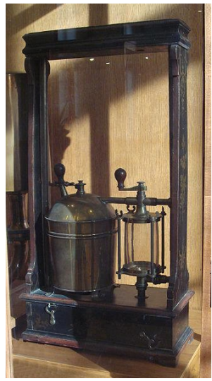
Fire pump, Savery system 1698, 18th century reconstitution

Water was the critical resource in the development and expansion of most settlements. The development of an artificial means of storing and distributing water was critical to the notion of material progress, and the image of an advanced and civilised city.