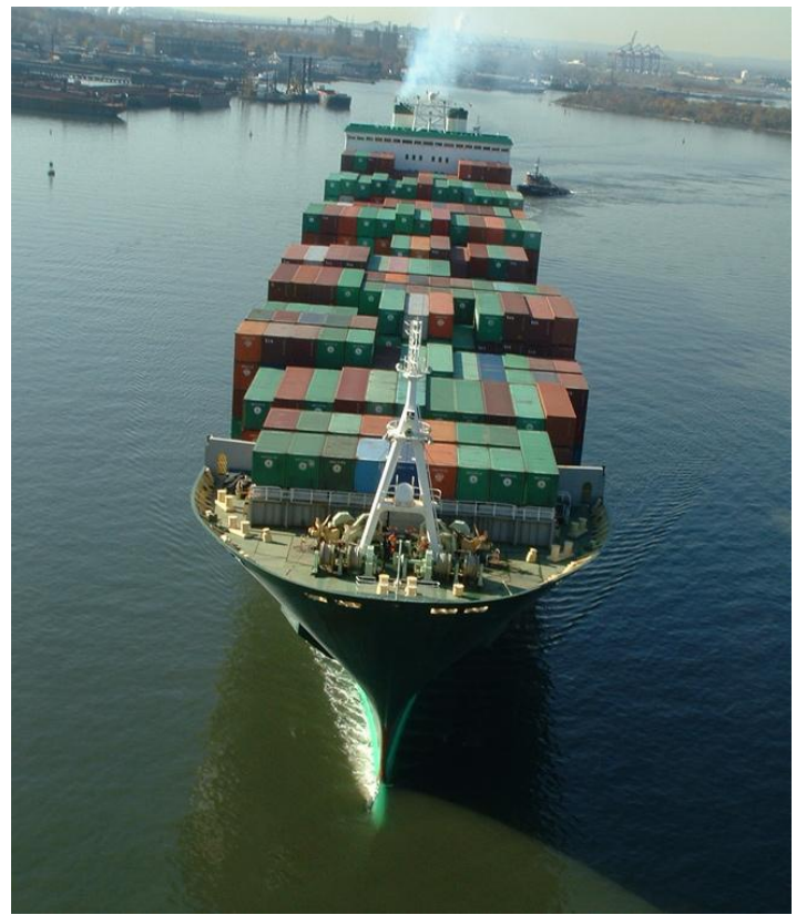
Container cargo ship