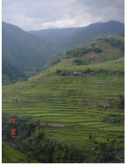
Rice Terraces of the Philippine Cordilleras

Again we find outstanding examples on the World Heritage List such as the Rice Terraces of the Philippine Cordilleras . "The rice terraces of the Philippines Cordilleras are over 2000 years old. They are living cultural landscapes devoted to the production of one of the world's most important staple crops, rice. The rice terraces are a dramatic testimony to a community's sustainable and primarily communal system of rice production, based on harvesting water from the forest clad mountain tops and creating stone terraces and ponds, a system that has survived for two millennia". (http://whc.unesco.org/en/list/722, see official listing Criterion iii)