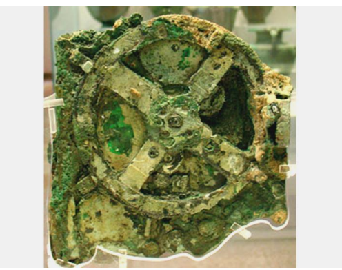
The Antikythera Mechanism (1st c. AD)

The long sea voyages created the need for mapping and for the discovery of mechanisms that could calculate elements such as the date or the position of the stars, which were necessary for the definition of the geographical coordinates. The Antikythera Mechanism (1st c. AD) constitutes the oldest known complex portable scientific instrument. The part that survives today consists of a system of gear wheels of different sizes, bearing inscriptions and rotating around different axes, thus offering information on the position and the periodicity of heavenly bodies (Kean, 1991).