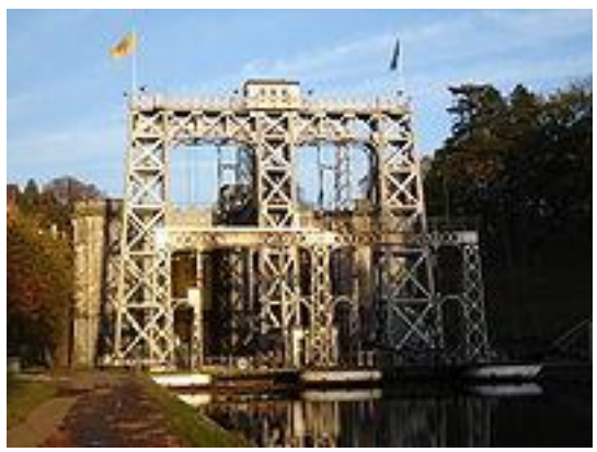
Lift No. 2, The four lifts on the Canal du Centre