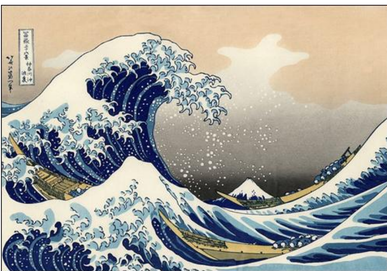
'Great Wave'. Japanese art prints or Ukiyo-e.

Of course, depictions of battles and ships are not the only artistic works relating to water and there are paintings throughout the ages that depict the human relation with water and its relaxing properties. In particular Japanese and oriental art works feature water in its various forms.