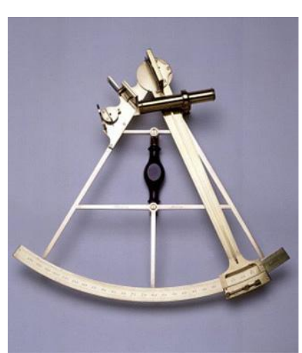
Captain Cook's sextant c. 1770