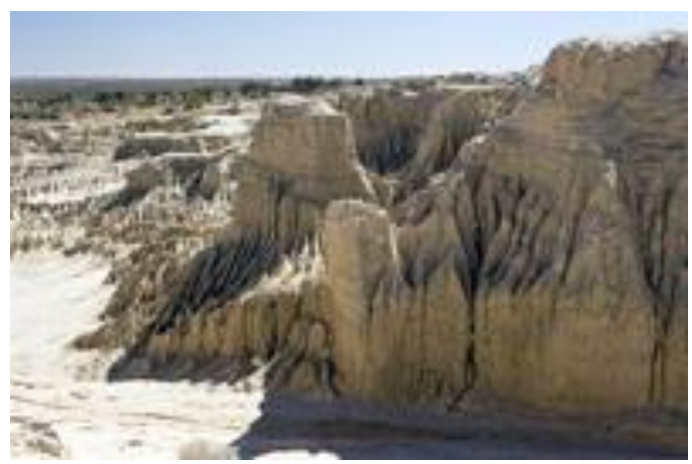
Willandra World Heritage Area

archaeological evidence of human occupation dating from 45–60,000 years ago. It is a unique landmark in the study of human evolution on the Australian continent. Several well-preserved fossils of giant marsupials have also been found here.