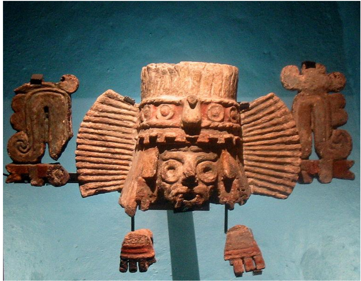
Fragments of a brazier depicting Tlaloc from Stage IVB of the Templo Mayor in Mexico City.

Water is important in Hinduism for its power to purify. The most notable feature in religious ritual is the division between purity and pollution. Most Hindus practice rituals as part of their daily life and purification by water is a typical component of many religious actions. To Hindus all water is sacred, especially rivers, and there are seven sacred rivers, namely the Ganges, Yamuna, Godavari, Sarasvati, Narmada, Sindhu and Kaveri.