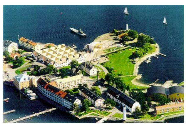
World Heritage Naval Port of Karlskrona