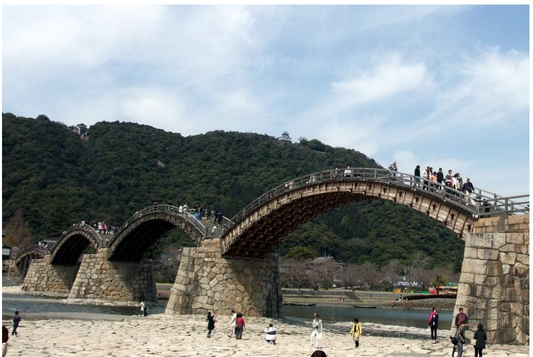
Kintai Bridge at Iwakuni, Yamaguchi prefecture, Japan